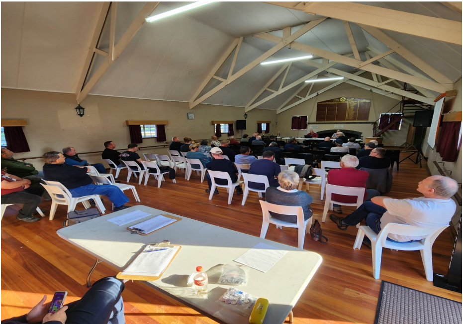
This years meeting was well attended, and after the meeting we all gathered around the fires to enjoy a braai which was enjoyed by all. See picture on Page 12 where it was dark before many of us went home.